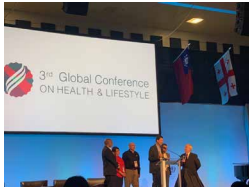
Dedication of the Hope Bible with Safeliz and the GC Health Ministry Team.