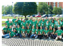
Attendees of the Youth Alive program in Lithuania.