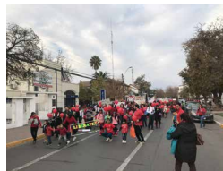
Participants marching to raise awareness on dangers of smoking.