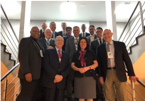
Participants of the SAD HM advisory and ARMin Global training in Brasilia.