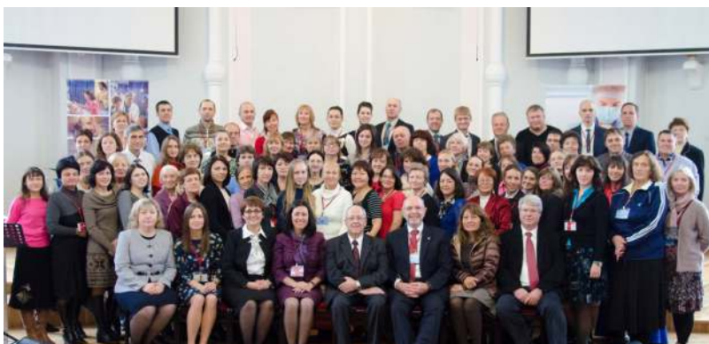
Attendees at the ESD Health Professionals Conference Conference

A group of health professionals and lifestyle health educators joined Union and Conference Health Ministries leaders in Zaosky from November 20-23, 2016, following the Division's Health Advisory. The goal was to provide them with a spiritual retreat and inspire them to engage in comprehensive health ministry. In addition, organizers aimed to provide further insight on how to expand the ministry of those already active as well as provide a networking opportunity for all. The health professionals came from lifestyle centers, hospitals, and clinics throughout the Division. They attended sessions together, and had group discussions within their specific disciplines. An Adventist Health Professional Association was solidified, and all left encouraged and inspired to extend Jesus healing ministry.