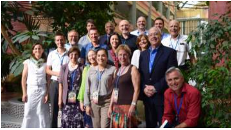
Group of Health Ministries leaders and officers who attended the EUD Advisory