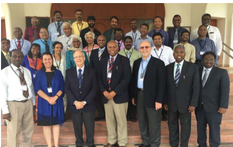
Attendees at the SUD HM Advisory in Hosur, India.