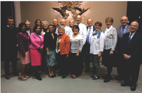
Participants of the GCNC meeting gathered at the GC Atrium on October 19, 2017.