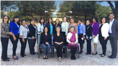
AINEC-LA participants representing Adventist nursing programs in Latin America.